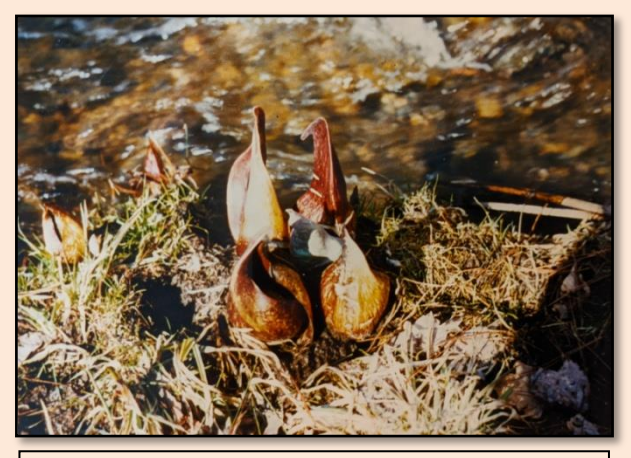
SKUNK CABBAGE

Here are some excerpts of her writings about spring flowers she found while exploring the meadows and woodlands of Boylston.