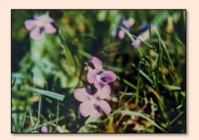
COMMON BLUE VIOLET

"During May we find violets in their prime. Perhaps the most common blue violet is the best known and most beloved by the children. The meadows are carpeted with the velvet blossoms. The tiny round leaved white violet is a near neighbor, and is faintly sweet scented. The lance lancet, too, is found in moist land. Its flower is white."