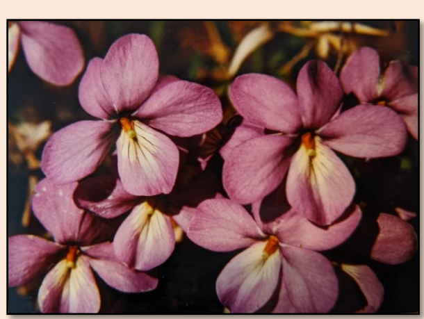
BIRD FOOT VIOLET