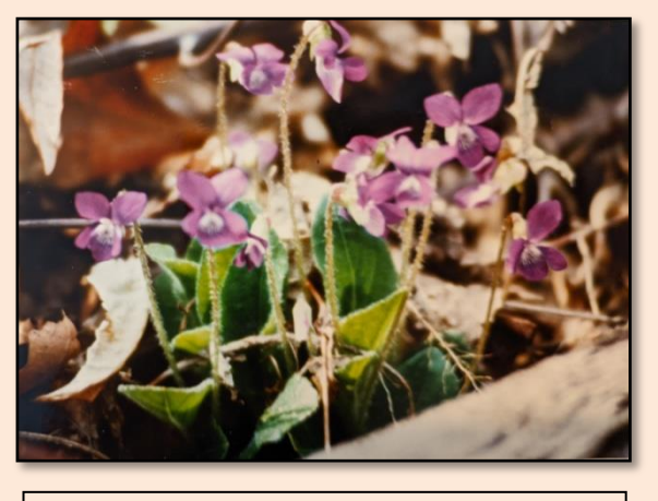
WHITE VIOLET

"The arrow leaved violet, blue in color, I have generally found on higher land, often in a dry wood."