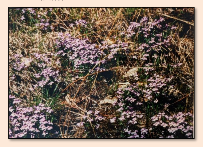
BIRD FOOT VIOLET FLOWER

"The bird foot violet, unlike other members of the family, has leaves which are divided into linear lobes thus resembling a bird's foot. Its lovely flower is especially striking, and is generally found growing in sandy soil. I well remember of our frequenting in childhood a pretty spot where these usually blue violets were a pure white."