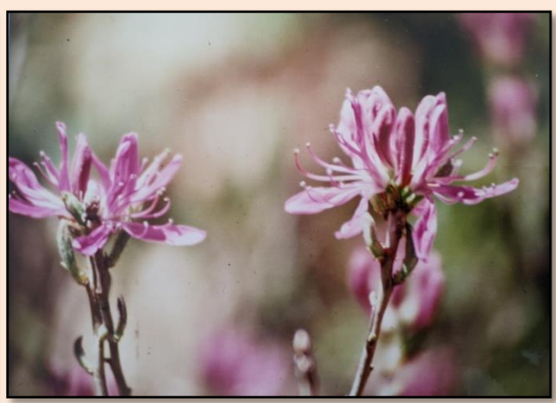
RHODORA BUSH